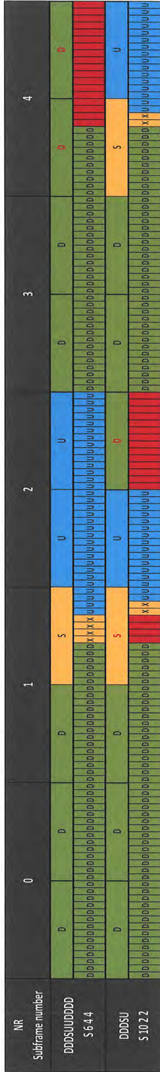
Figure 2: Frame structures with the implementation of DSB (red symbols = blanked symbols)

In order to allow in border areas, the interference free coexistence between the two frame structures given in the section above, the downlink symbol blanking (DSB) feature may need to be activated 3 . The requirement for the activation/ implementation of this feature is laid down in the sections 3.1 and 3.2.